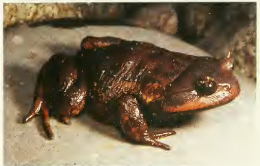
FIGURE 1. Brachytarsophrys feae , Northern Myanmar.

The males of Brachytarsophrys feae (Fig. 1) were found in evergreen montane forest at an elevation of 1,085 m. All individuals were found under rock overhangs which formed small caves in the middle of shallow slow flowing streams. In all instances, the opening to the cave faced downstream, and the substrate was gravel or cobble. Individuals were found in regions where the stream was densely covered by canopy. The stream width was about 1.5 meters, and the banks were heavily vegetated. Five males were heard calling at one locality near Ngar War Village, Hkakabo Razi National Park, Kachin State, Myanmar (27°50'03.5"N, 97°45'40.8"E). The call of one individual (SVL 116.2 mm) was recorded at 2145 hrs. during